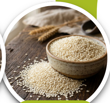
Hulled Sesame Seeds