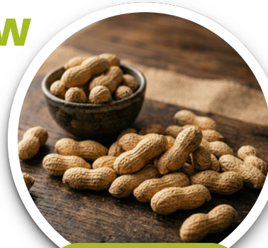
Peanuts in Shell

We offer a variety of groundnut products suitable for food processing, snack manufacturing, confectionery, and oil extraction industries, ensuring consistent quality and reliable supply.