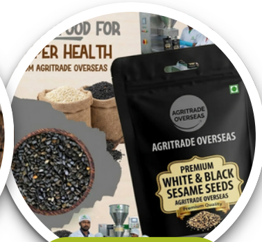
Export Grade Quality