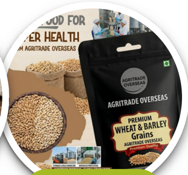
Export Grade Quality