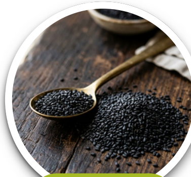
Black Sesame Seeds