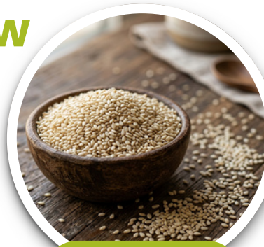
Natural White Sesame Seeds

Widely used in food processing, bakery products, confectionery, and oil extraction industries, our sesame seeds meet international export standards and customer requirements worldwide.